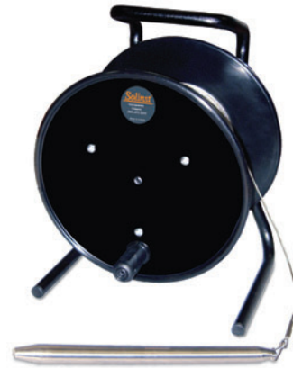
Tag Line / Suspension Cable

Tubing most commonly used is low density polyethylene (LDPE), however, Teflon® or Teflon-lined polyethylene tubing is also available. Depth markers may be ordered for the tubing in either feet or meters, as an optional extra.